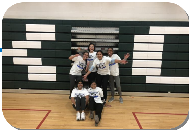
The all female group of Young Leaders at Kate Chegwin Jr. High! This is the school's 3 rd year being involved in the program!

We are excited to also be working with 4 new programs once the New Year rolls around!