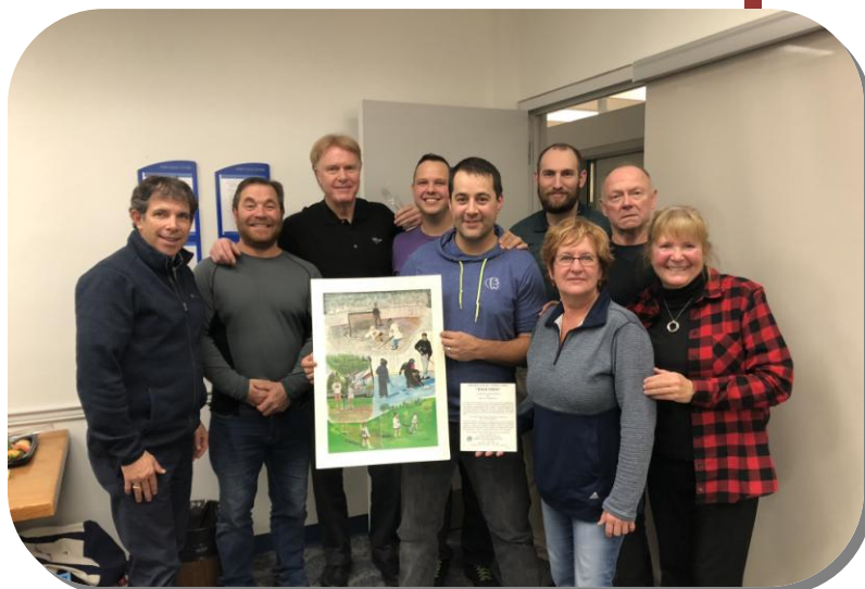
Members of our Board at the 2018 Annual General meeting