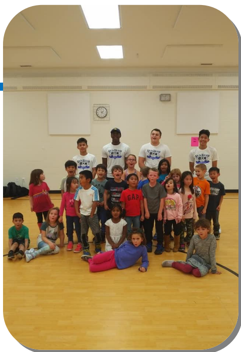
This is the 5 th year that St. FX's Senior Boys Basketball team has run a FunTeam Young Leaders Program. This time they partner with Bishop David Motiuk's Grade 1-4's to get them physically active.